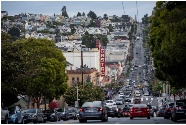
Castro Street in San Francisco, Calif.