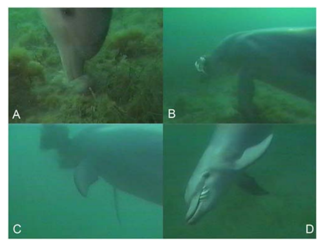
Figure 2. Prey handling of giant cuttlefish ( Sepia apama ) by Indo-Pacific bottlenose dolphin ( Tursiops aduncus ). Prey: (a) pinned to substrate and killed; (b) lifted towards surface; (c) beaten with snout to release ink; (d) consumed whole. doi:10.1371/journal.pone.0004217.g002

Prey positioning: Cuttlefish prey were typically hiding amongst dense brown algae. On encountering the cuttlefish, the dolphin flushed the prey away from algal cover into areas of open sand (Fig. 1a).