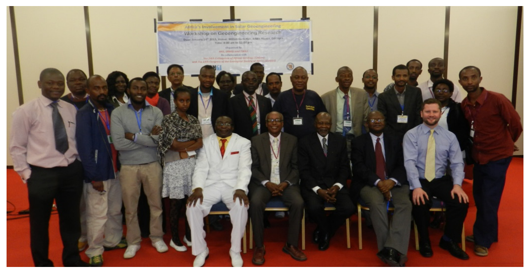
Participants of the January 2013 workshop held at Millennium Hall, Addis Ababa, Ethiopia