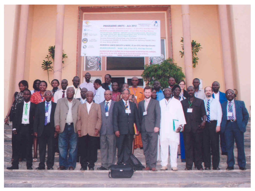
Participants of the June 2012 workshop held at Hotel Ngor Diarama, Dakar, Senegal