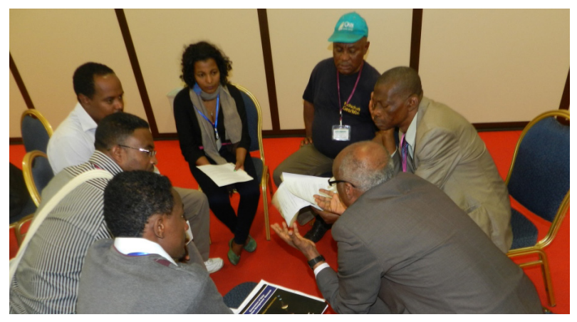
Workshop participants discuss research governance in Addis Ababa, Ethiopia

"Research and development of small scale outdoors research must be facilitated and also regulated. It is only at this scale of research that needed information can be collected for informed decision making. Development of the technology may have cross-boundary consequences and therefore regulation at both the national and international level could be beneficial."