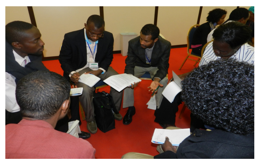
Participants in Addis Ababa, Ethiopia explore governance options in workshop exercises

The organisers tried to attract a wide range of stakeholders to each workshop, and participants across the workshop series included academics, policymakers, representatives of NGOs, the media, and members of the public who saw advertisements in local newspapers. The series of workshops attracted over 100 participants from 21 different African countries. It is perhaps inevitable that the single group most strongly represented was scientists, as the meetings – while open to all interested participants – were held in conjunction with scientific conferences, and since much of the discussion of SRM has been in scientific circles.