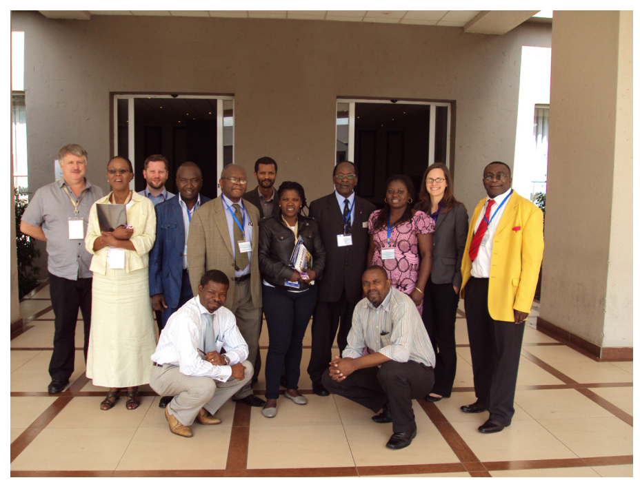
Participants of the November 2012 workshop held at Birchwood Hotel, Boksburg, South Africa