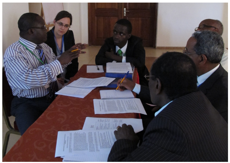
Participants in Dakar, Senegal break into groups to discuss workshop exercises

The objectives of the workshops were to introduce African stakeholders to the concept and implications of SRM, to seek opinions and ideas on how SRM research might be governed, and to create the conditions for more sustained engagement in Africa on SRM research governance. In each workshop, participants were encouraged to engage in the discussions and explore their views and opinions together. In this way, the workshops were designed to foster the development of a cadre of African experts (scientists, ethicists, lawyers, journalists, etc.) who are aware of the issues relating to SRM, and to build a foundation in Africa for an informed and cooperative future global dialogue on SRM research governance that includes more African perspectives.